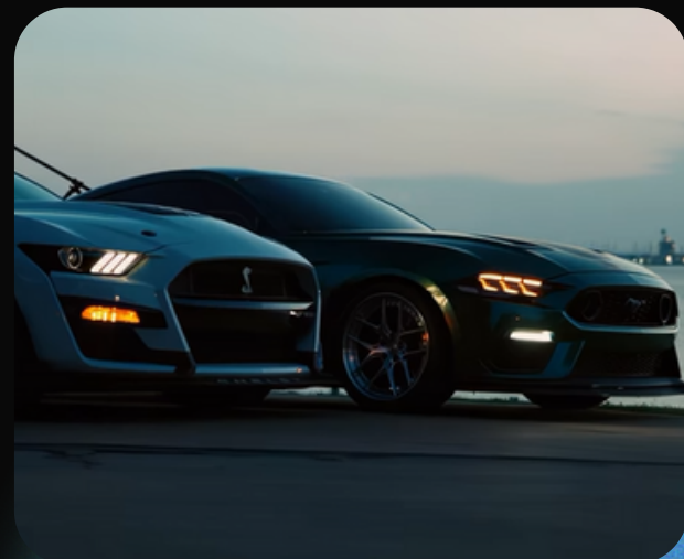
DA Frames @da_frames